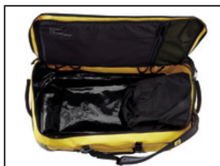
Large D-shaped opening for easy equipment organization

Designed to be carried in multiple ways, DUFFEL 85 is a convenient ergonomic bag with a volume of 85 liters. The back and shoulder straps are padded for comfort when used as a backpack. Versatile, it can be carried in multiple ways, thanks to the removable shoulder straps. It has a large opening which allows easy access to equipment, two pockets in the inner flap and a large side pocket for a helmet or shoes. A large transparent area allows rapid identification of the bag. It is constructed of high-strength TPU tarp fabric, for intensive use.