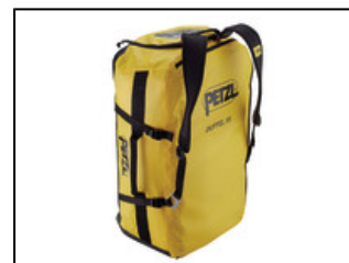
Padded, adjustable back and shoulder straps for comfortable carrying